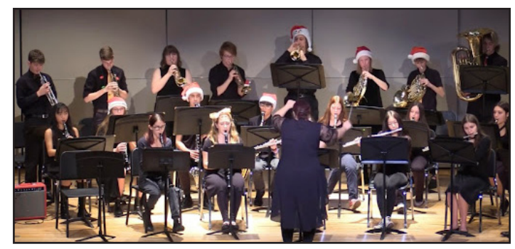
Senior High Symphonic Band