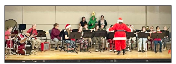
Junior High Jazz Band members performed at the holiday assembly.