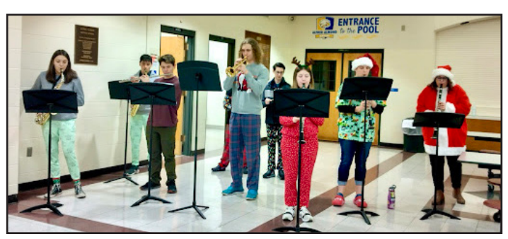
Jazz Band members performed holiday carols during student arrival.