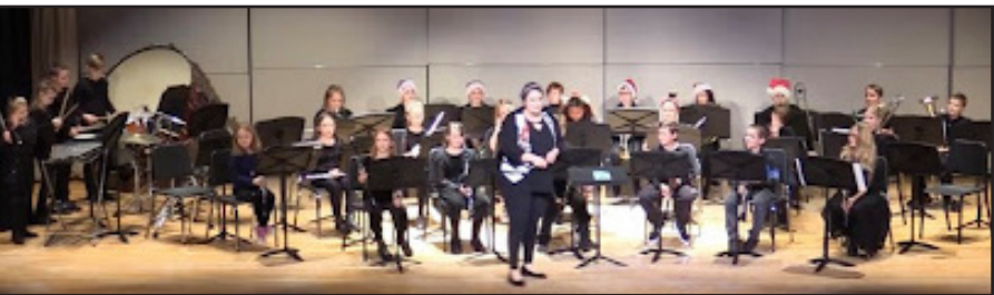
Fourth Grade Beginning Band