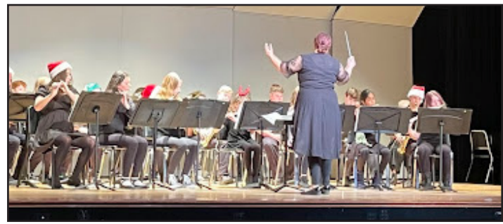
Junior High Concert Band